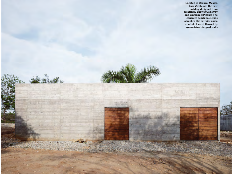
Located in Oaxaca, Mexico, Casa Zicatela is the first building designed from scratch by Ludwig Godefroy and Emmanuel Picault. The concrete beach house has a bunker-like exterior and a central element flanked by symmetrical stepped walls

A chance meeting in a jazz bar has led to one of Mexico's most spirited architectural collaborations